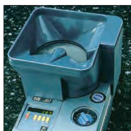
Automatic coin hopper (SC 313)