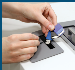
USBs and SD Cards