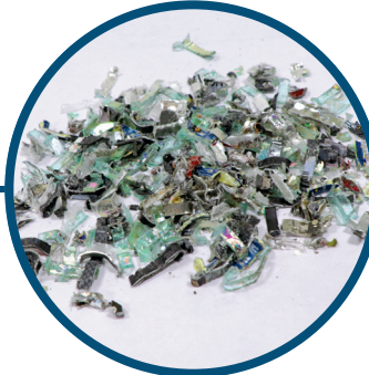
Media Shredding: Shreds media into random pieces up to 0.60". Perfect for security and peace of mind