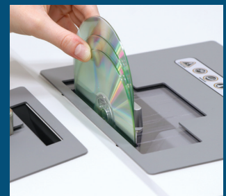
CDs and DVDs