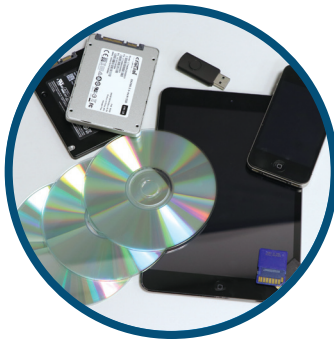
Multimedia Devices: Easily shreds a variety of media from mobile phones to mini tablets