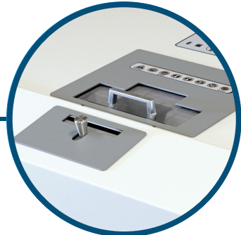
3 Dedicated Infeed Options: Safely feed various size media through the appropriate infeed, up to 6.5" W