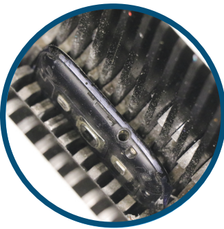
Commercial Grade: Solid-steel heat-treated blades and rugged chain-driven motor