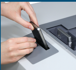
Mobile Phones and SSDs