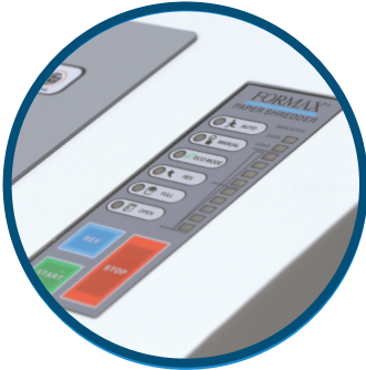
User-Friendly Control Panel: ECO Mode, Door Open Sensor, Reverse, Bin Full Indicator

The Formax FD 87SSD OnSite Multimedia Office Shredder is designed for the modern technological world. It easily shreds mobile phones, SSDs, mini tablets, USBs, and more. The FD 87SSD is whisper-quiet and operates on standard 120V power , making it ideal for the office environment. It features a user-friendly LED control panel , a sturdy all-metal cabinet on casters , solid steel cutting blades , and a rugged chain-driven motor . The separate enclosed infeed options allow users to safely shred a variety of media up to 6.5" wide. With its commercial-grade construction and features, the FD 87SSD sets the standard for safety and security.