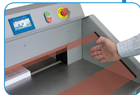
Infrared Safety Curtain shuts down operation if the beam is interrupted