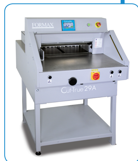
Standard model, without optional wide side tables