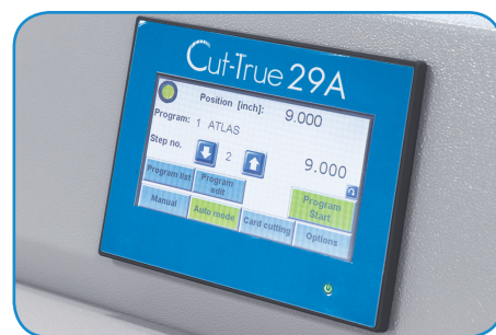
Full-color touchscreen control panel allows for programming up to 100 jobs

* 31"W with safety curtains removed for easier transport through doorways. 33.5"W including safety curtains.